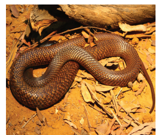
WESTERN BROWN SNAKE (OR GWARDER)

Colour: from light brown to dark shade Markings: sometimes with crossbands