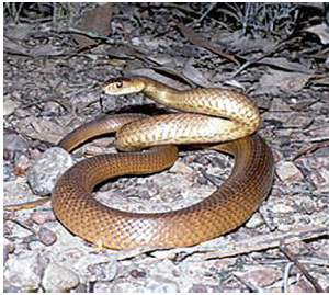
EASTERN BROWN SNAKE

Nature: Highly venomous and extremely fast.